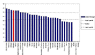
Figure 3 - BVPI 74b: Satisfaction of BME tenants with the overall housing service 2002/03

266 The Locata partnership provides the opportunity for sharing, reviewing and agreeing good practice among its members. The operations and development group reviews the day to day operation and the effectiveness of the scheme. This includes considerable benchmarking work across the eight partners. However, most of this work compares differences in procedures and practices, rather than measured outcomes such as void turnaround.