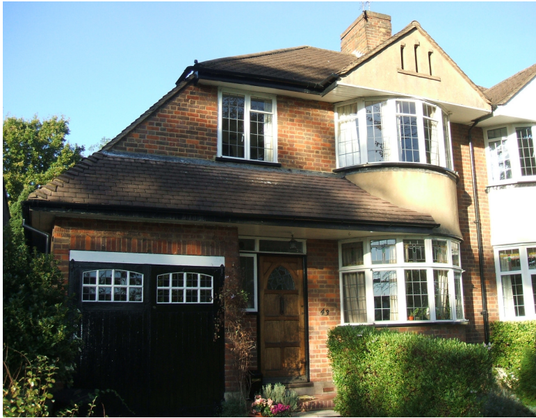
House with original windows and doors