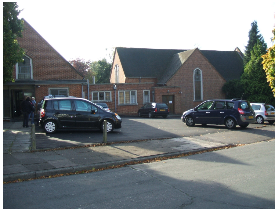
Eastcote Methodist Church Hall, Pamela Gardens