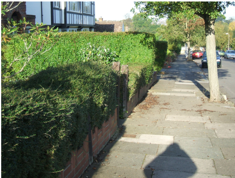
Green boundaries and low decorative brick walls