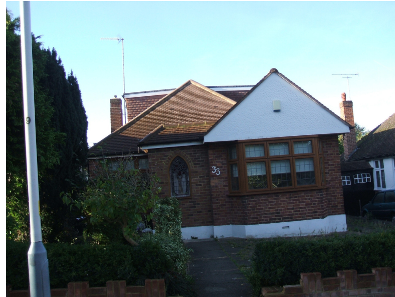
Altered property with roof additions