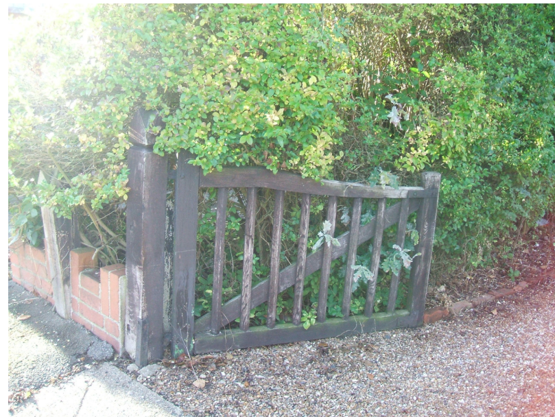
Original timber gate and post for chain link fence