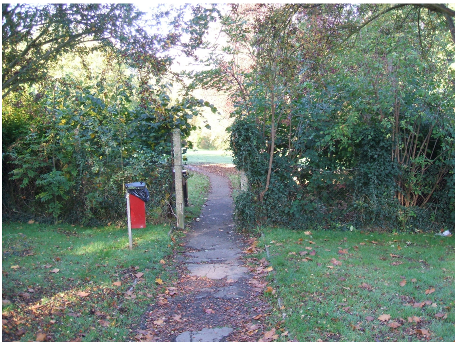
Entrance to Eastcote House Gardens