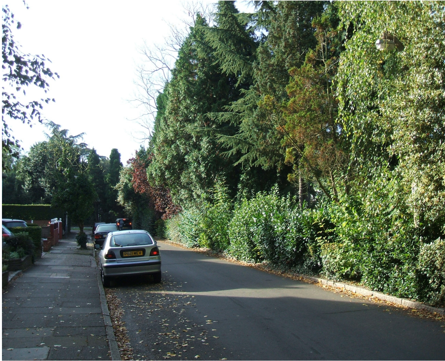
View of mature island planting at entrance to St Lawrence Drive