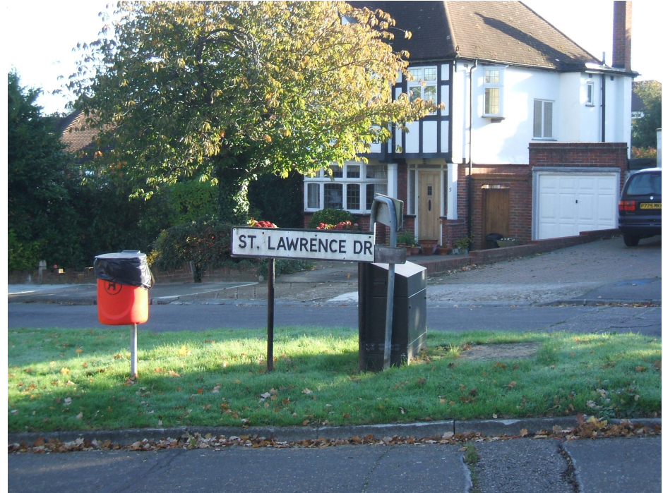
Signs and street clutter in St Lawrence Drive

In general, local residents appreciate the qualities of the Estate and there is a desire to retain its special character. There are, however, problems related to maintenance of the public realm and there is a need to combat pressures for the inappropriate development or alteration of individual properties. The character of the area is derived from the groups of distinctive buildings and the quality of their design features, its green landscaped setting and undulating topography. The latter creates visual interest, with changing views and vistas that are an important element of the area's character. Ill considered and piecemeal alterations could erode this special character if allowed to proceed unmanaged.