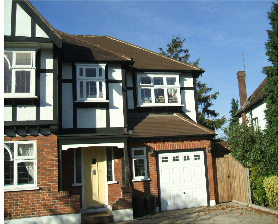
A sensitively extended property