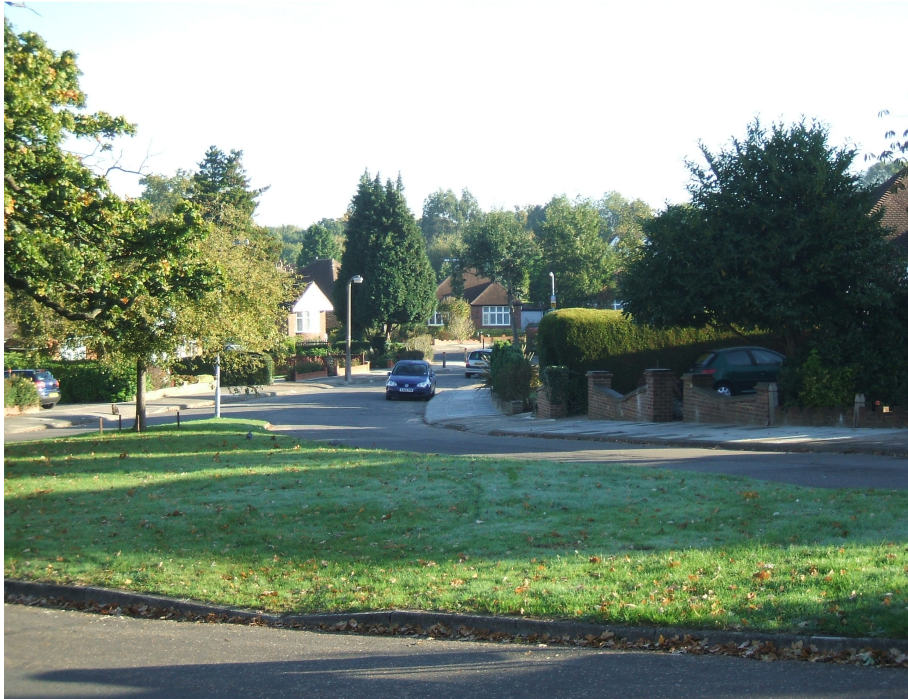
View of St Lawrence Drive looking north east

This Management Plan is designed for use in conjunction with the Eastcote Park Estate Conservation Area Appraisal. The appraisal highlighted some of the problems and pressures affecting the Conservation Area whilst this Management Plan seeks to address these issues with policies and guidance for the protection and enhancement of its special character.