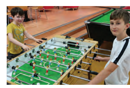
low cost and all young people aged five to 19 could take part in them.