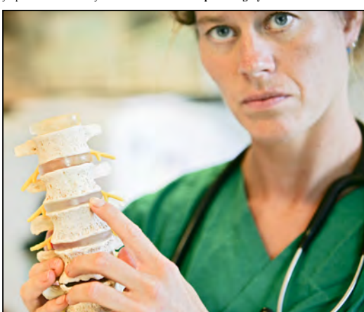
The pain of a bulging disc can be successfully relieved in an average of 88% of cases.

breakthrough in the treatment of Bulging DISCs. It's a new procedure called Non-Surgical Re-Constructive Spinal Care. The excellent results from this treatment