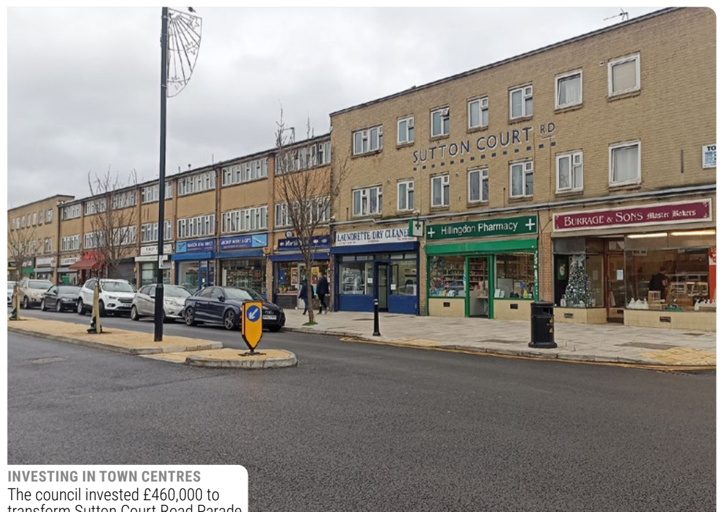
INVESTING IN TOWN CENTRES The council invested £460,000 to transform Sutton Court Road Parade