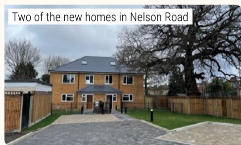
Two of the new homes in Nelson Road