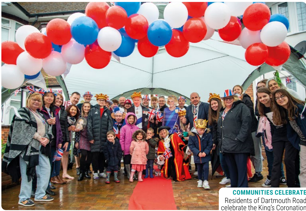
COMMUNITIES CELEBRATE Residents of Dartmouth Road celebrate the King's Coronation