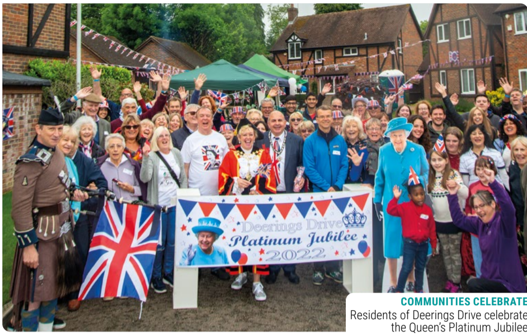
COMMUNITIES CELEBRATE Residents of Deerings Drive celebrate the Queen's Platinum Jubilee