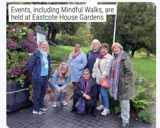
Events, including Mindful Walks, are held at Eastcote House Gardens