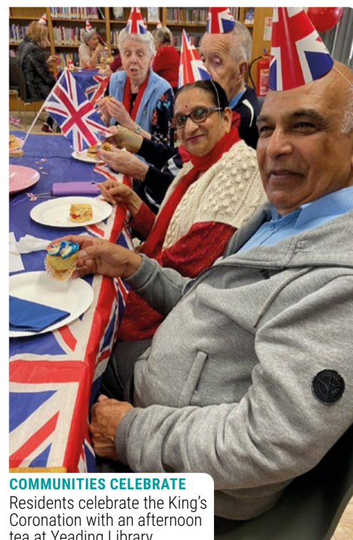
COMMUNITIES CELEBRATE Residents celebrate the King's Coronation with an afternoon tea at Yeading Library